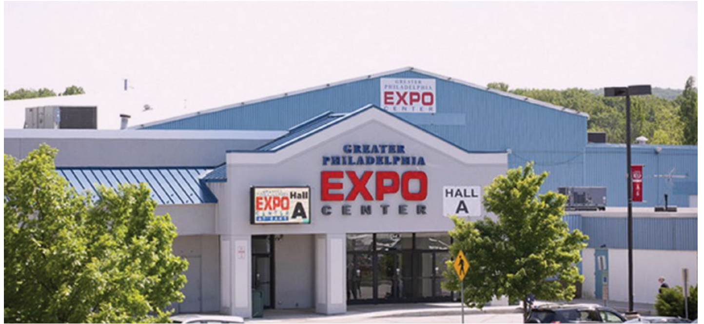
The Eastern Pennsylvania Annual Conference will be held at the Greater Philadelphia EXPO Center in Philadelphia, PA.

“As we gather, God’s possibilities continue to bless us,” the bishop writes in his Pre-Conference Workbook greeting. “We celebrate the work of Project Restoration, as we work to restore our communities following Hurricane Ida. We give thanks for the relaunch of our Camp and Retreat Ministries and the IGNITE conference.