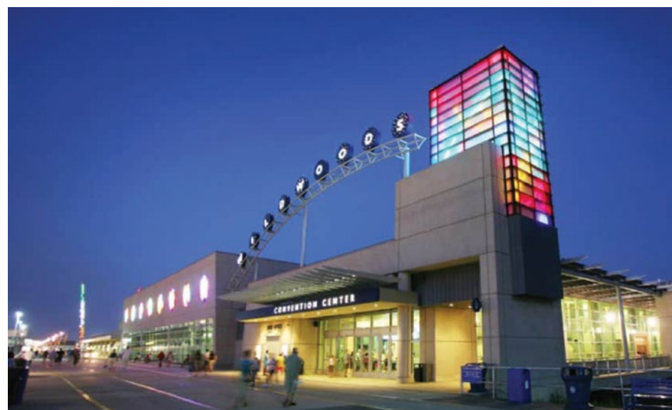
GNJ Annual Session convenes at Wildwood Convention Center in Wildwood, NJ.

During our time of holy conferencing, we will join in praise and worship, including sharing in Holy Communion on scenic Wildwood Beach to welcome