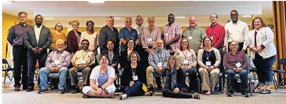
EPA assisting elders received "coach approach" training in 2022, which prepared them to help pastors lead Pathways congregations into greater health and vitality.