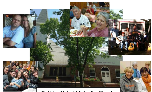
Dobbins United Methodist Church